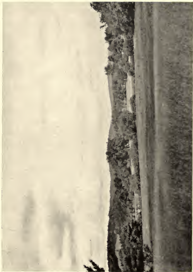
MENAMESSET LOWER VILLAGE